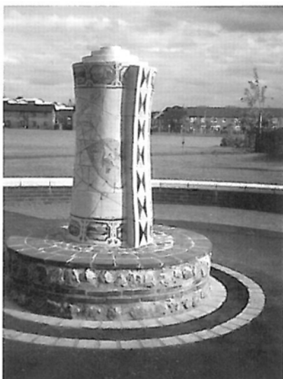
Rory McNally and Chloe Cookson | Bede Park, Leicester

Ideas were developed with community groups and art works were placed as roundabouts where Sustrans cycle way crossed pedestrian paths. A tall ceramic sculpture 'Making a Place' represents a map of Leicester in a rolled-up carpet form that corresponds to the way the park was set down all at once as though unrolling a carpet. The second sculpture 'Wildlife Map' illustrated species found in the area. Linocuts were stamped into clay tiles to create an embossed design. A full-scale model was built in plaster and 180 components were cast from individual moulds. The painted and glazed tiles were built up in a precarious tower and fired to frost proof temperatures. Both sculptures were popular, especially the humorous imagery and local references in canal-boat style of